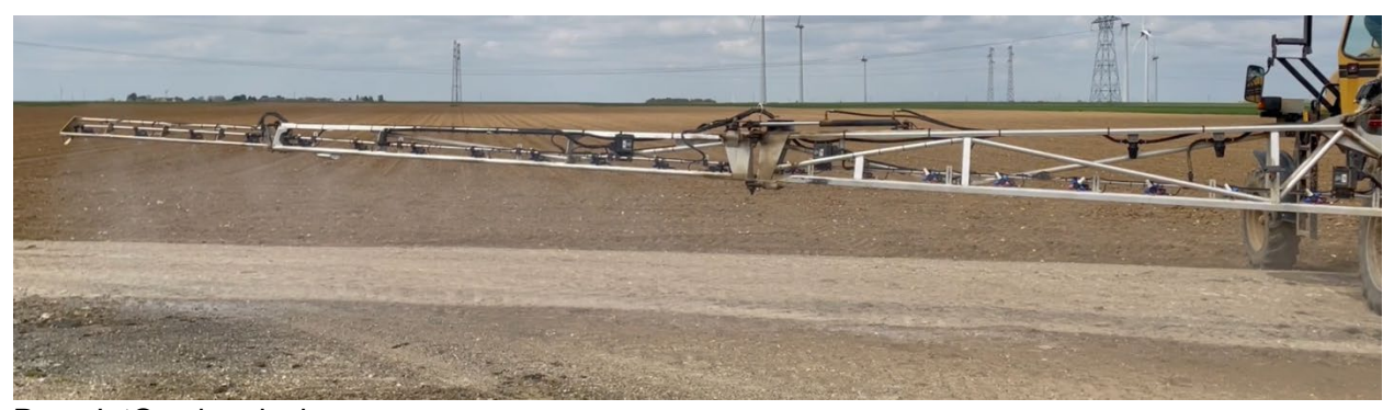
DynaJet® valve rinsing

Before you winterize the sprayer, we recommend washing and rinsing the spray boom as explained in the "Daily maintenance of the DynaJet® valves".